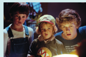
Six-year-old Barrymore made her big-screen debut as Gertie in Steven Spielberg’s blockbuster E.T. the Extra-Terrestrial (1982).

Showbiz came early for Barrymore, who was cast in her first commercial before turning a year old. She comes from a long line of Hollywood royalty.